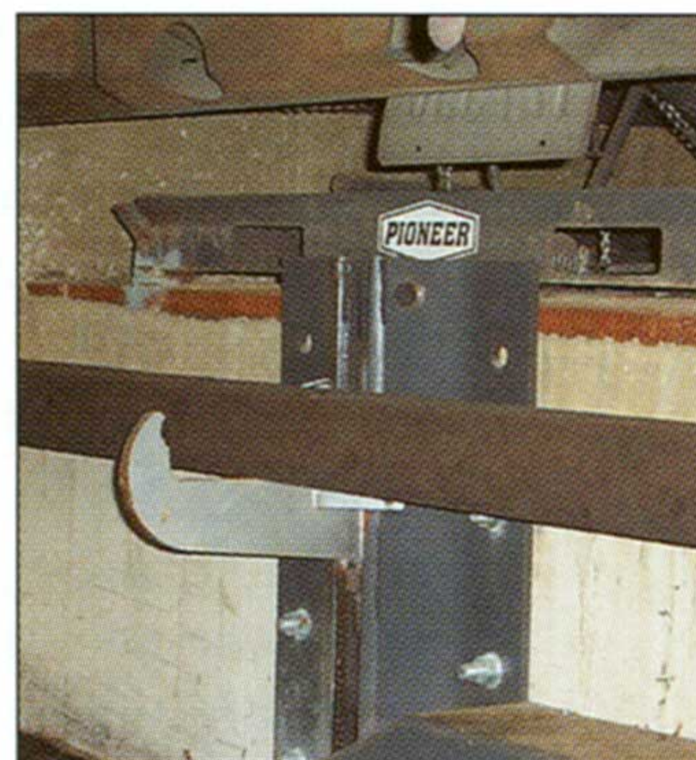
Positive Contact Hook captures and holds all legal ICC Bars.

Inside/outside Automatic Light System with safety signs.